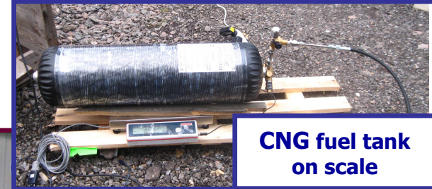
CNG fuel tank on scale